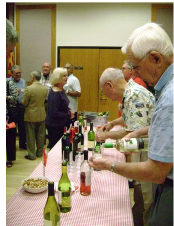
Bar tenders at work

Come and try a variety of wines and cheeses at this popular event. You can swap stories with newcomers and your Canadian friends over a variety of wines. It will be held at the Canoa Hills Recreation Center, Sunday, 23 January, 2011, from 3 to 5 pm . There will be a small charge to cover the cost of the wine and cheese. We'll send out an email reminder and ask you to RSVP.